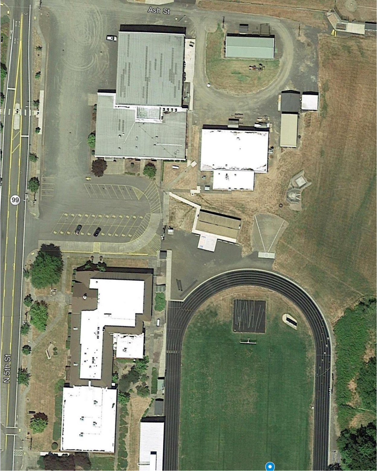
Figure 3 Map