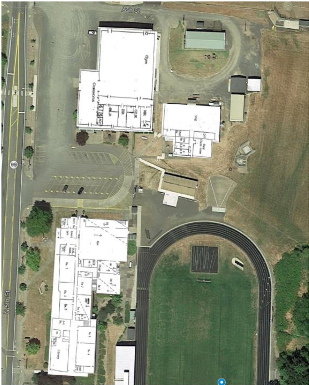
Figure 2 Drawing Map Overlay