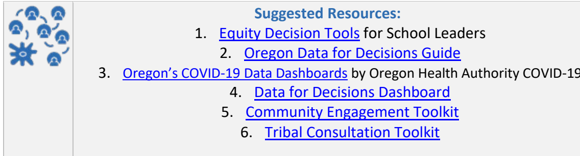
Table 3. Centering Equity